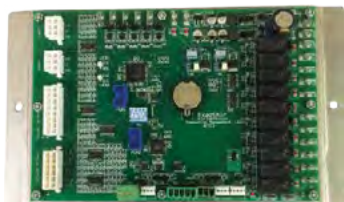
Unit Control Board Within the AAON Rooftop Unit