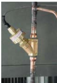
Modulating Control Valve