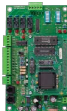
Modulating Reheat Electronic Controller