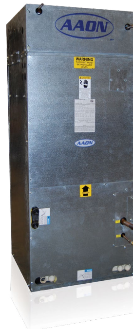
Multi-Position Configuration with Modulating Hot Gas Reheat

Factory installed and configured variable speed ECM driven supply fan for each F1 Series model and can be field configured and optimized based on the local climate and application. ECM technology is both reliable and ultra-high efficiency, dramatically increasing the system's SEER ratings. The electronically controlled motor quietly varies the fan speed to maintain air volume and provide exceptional temperature control for consistent comfort.